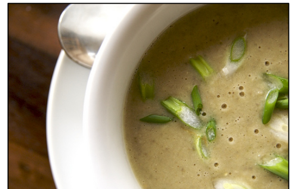
Mushroom mustard soup