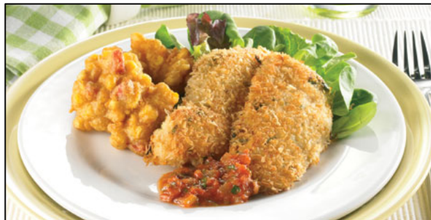
Mustard crumb fried chicken